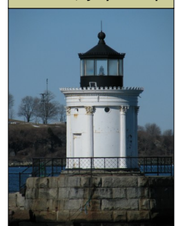
USA 00¢ July stamp

Penny Overton, Editor 542 Maine St New Gloucester, ME 04260-2661